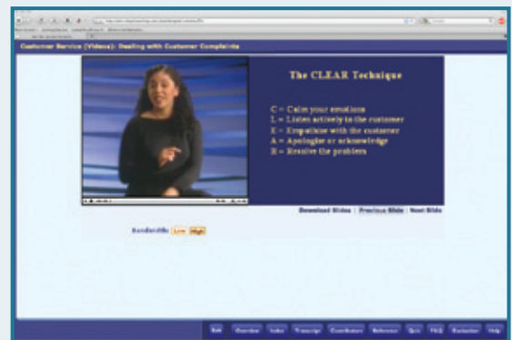
Industry Standards and State-Required Courses